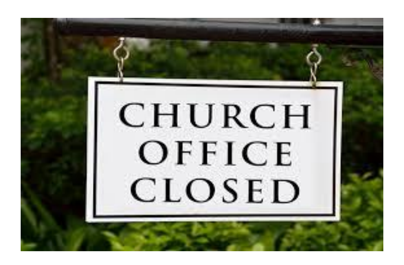
Friday December 23 and December 30